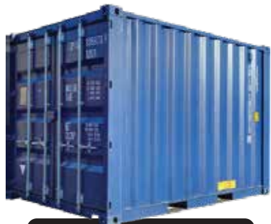
10' Shipping Containers