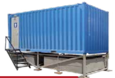
Ablution Unit Containers