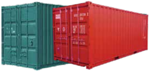
20' / 40' / 40' HQ & 45' HQ Shipping Containers