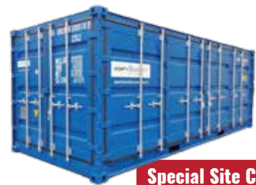
Special Site Containers