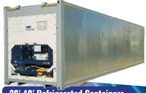
20' 40' Refrigerated Containers