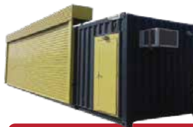
Workshop w/Office Containers