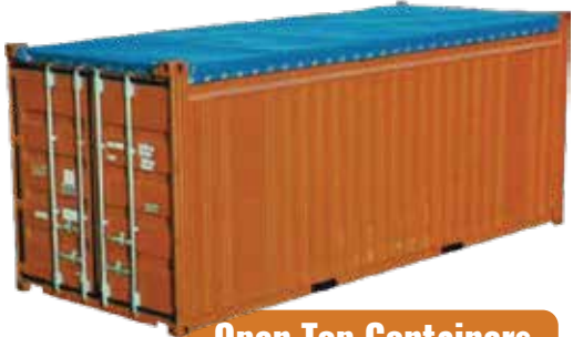
Open Top Containers