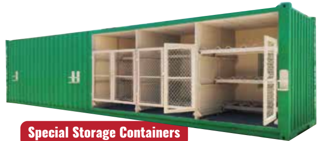
Special Storage Containers