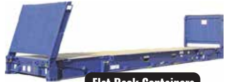
Flat Rack Containers