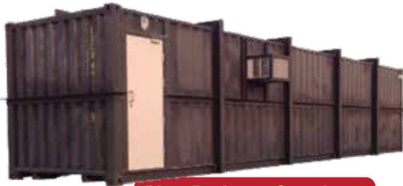
Blast Resistant Containers