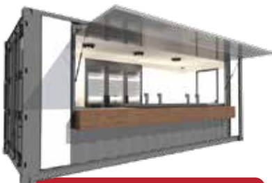
Special Designed Containers